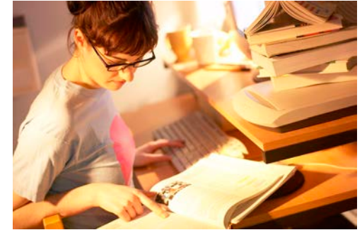
Many NAPP members are solo practitioners.

Every summer NAPP offers an affordable CLE conference that includes three full days of interactive classes and opportunities for face-to-face networking.