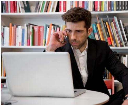
Checking the NAPP forums for expert advice.